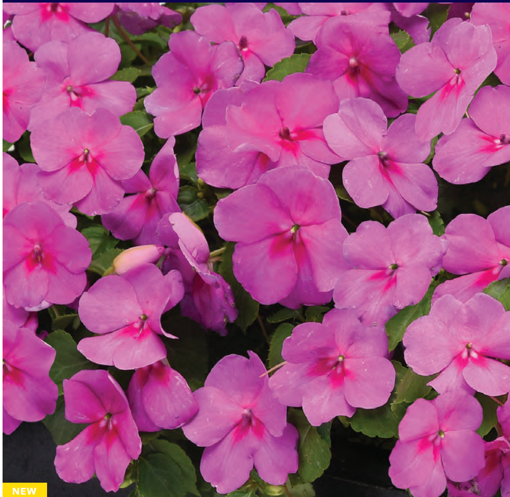
NEW Blue Pearl

Beacon announces two NEW colours to light up the shade. NEW Blue Pearl and NEW Light Pink have been trialed and approved to grow well and look vibrant in the shade, and they offer high resistance to the widely prevalent populations of Plasmopara destructor , the cause of Impatiens downy mildew. Beacon Impatiens are suitable for packs, pots, hanging baskets and in-ground beds. Visit beaconimpatiens.com for more details on the Beacon story.