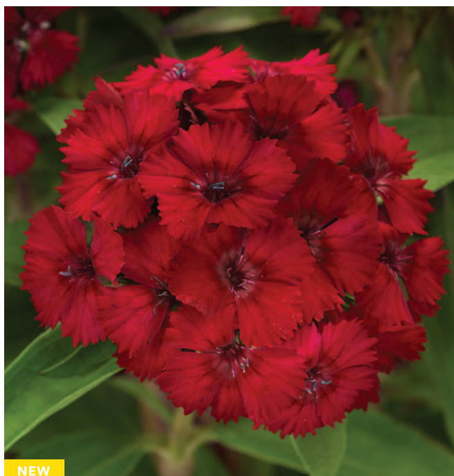
NEW Dart Raspberry Dianthus