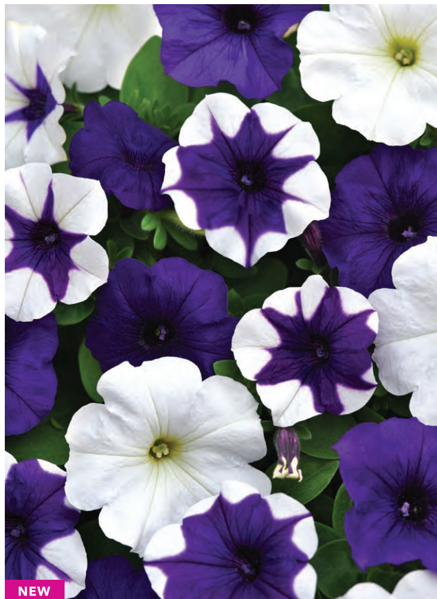
Deja Vu Mixture