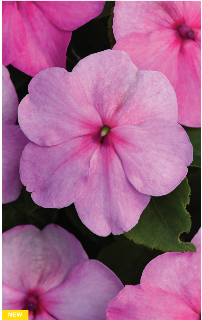
NEW Light Pink