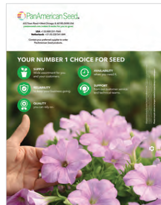
NEW Easy Wave Pink Pearl Spreading Petunia