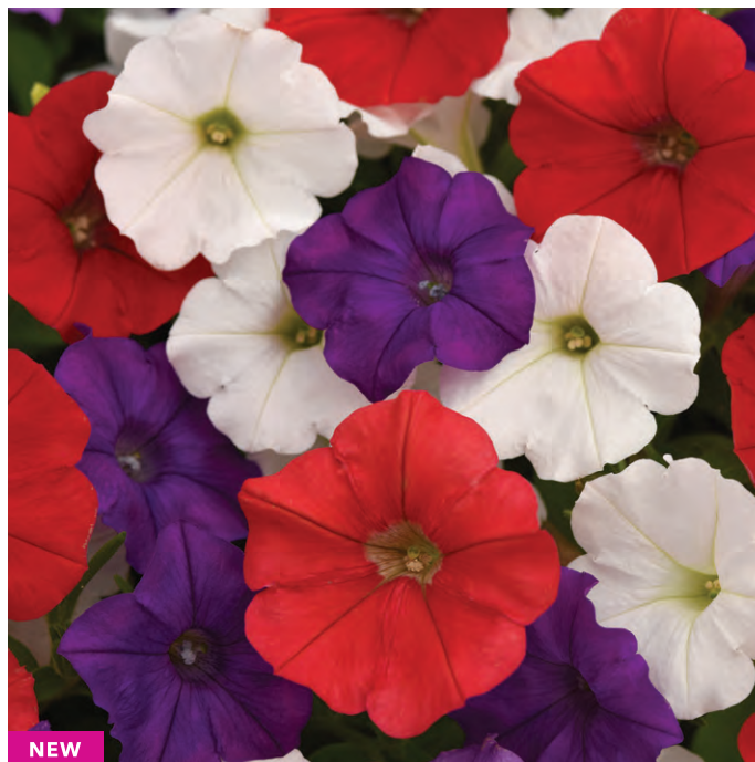
Shock Wave Violet