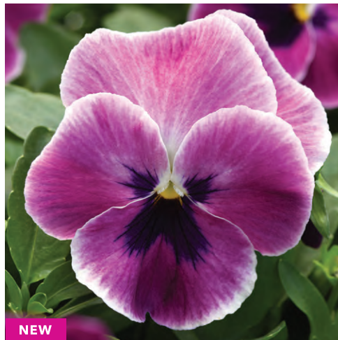
NEW Pink Shades