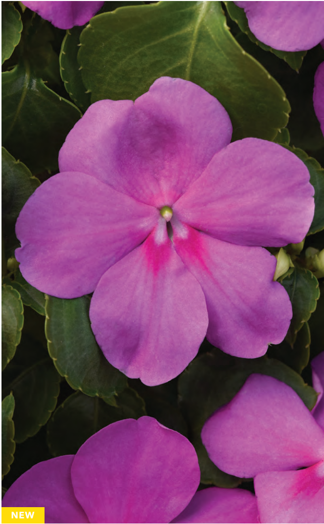
NEW Blue Pearl