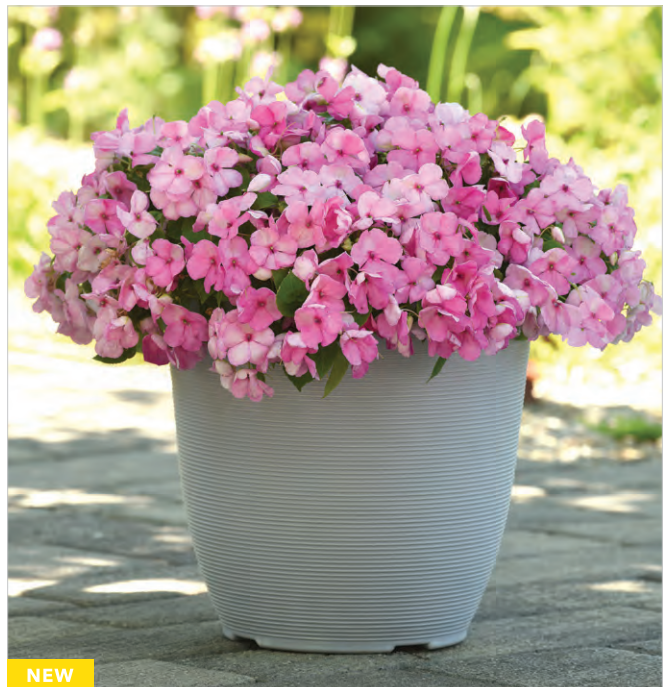
NEW Light Pink