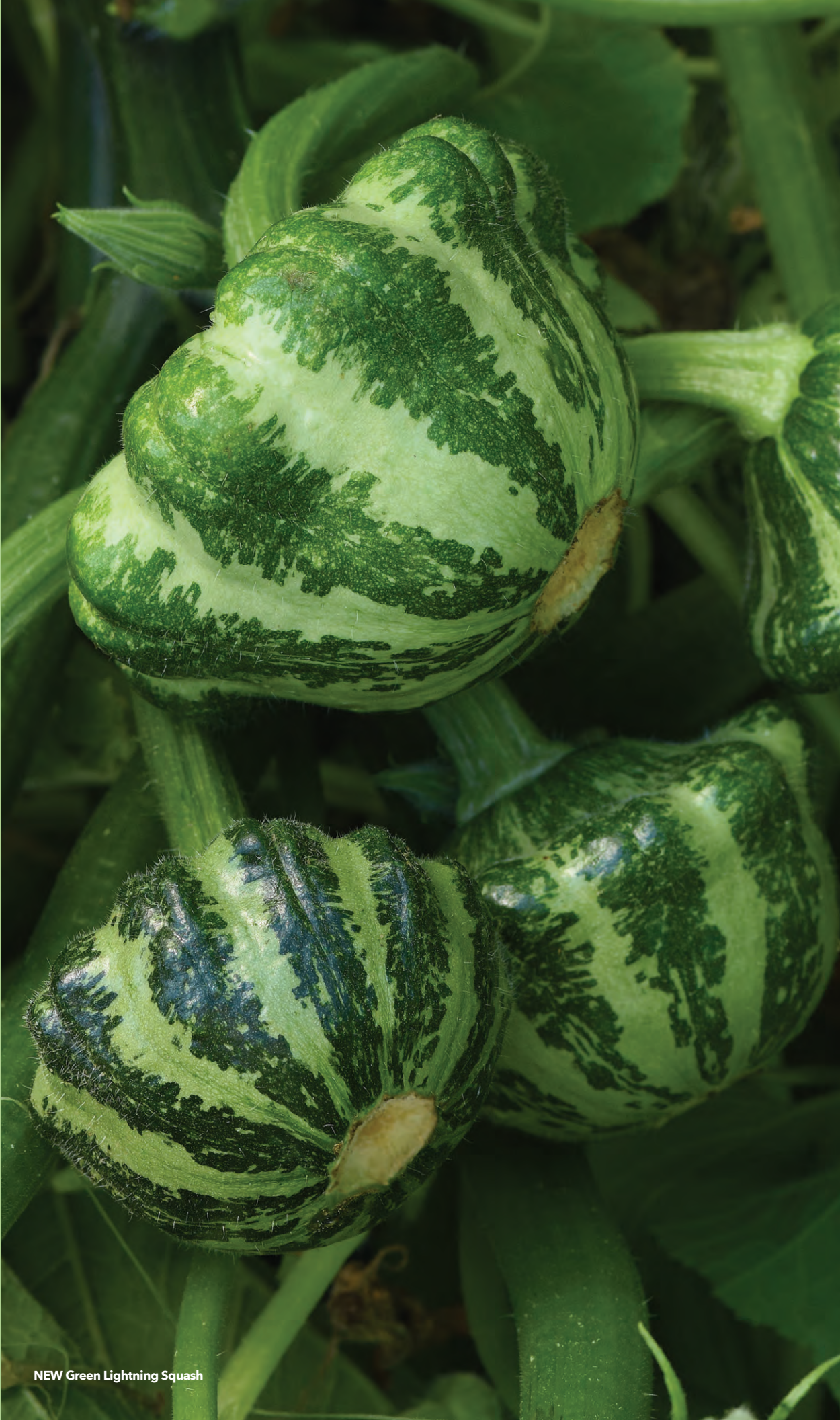
NEW Green Lightning Squash