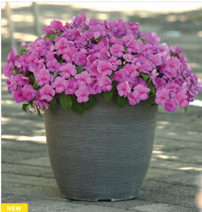
NEW Blue Pearl