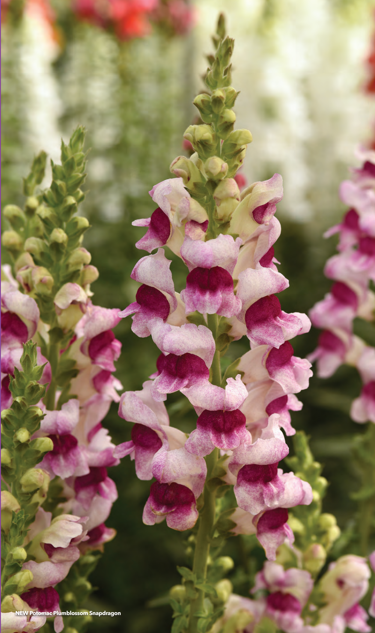
NEW Potomac Plumblossom Snapdragon