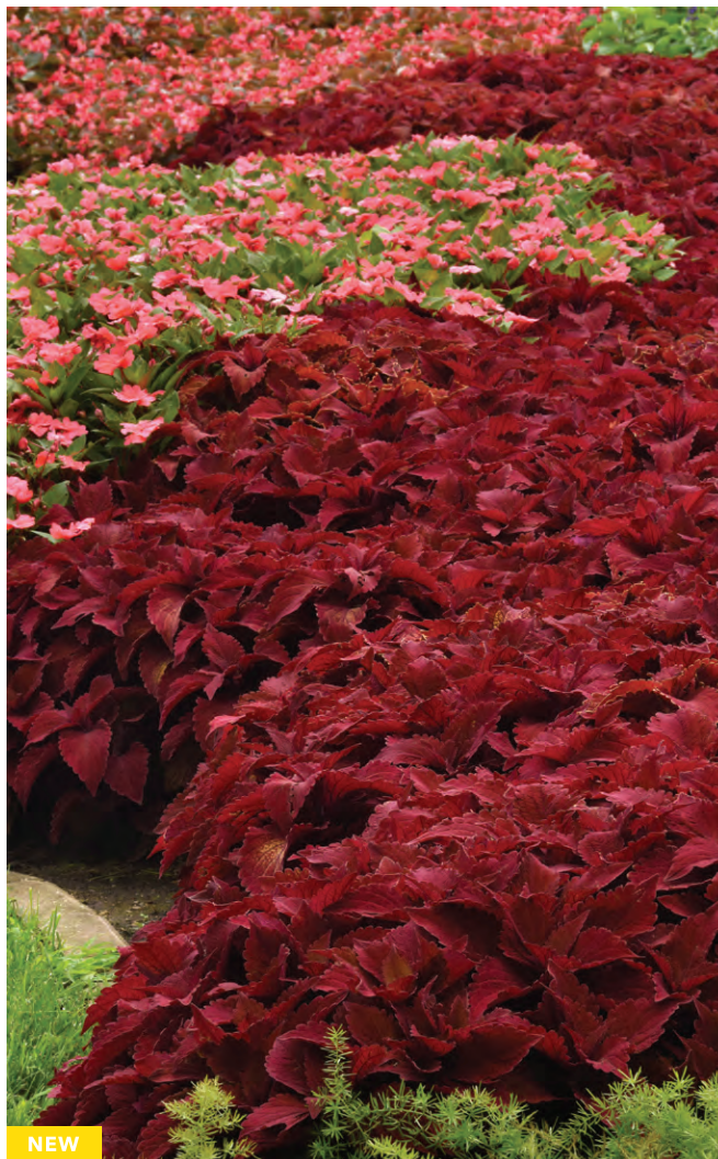
NEW Sweet Paprika Coleus

Fits the series very well and could be considered as the prototype for timing and habit.