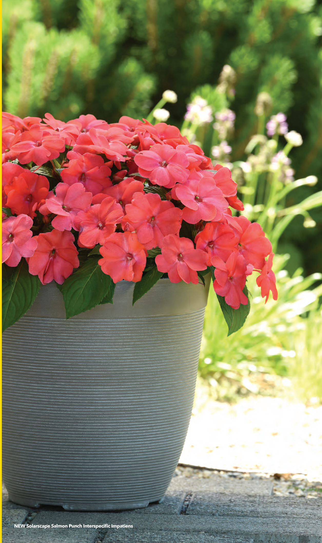
NEW Solarscape Salmon Punch Interspecific Impatiens