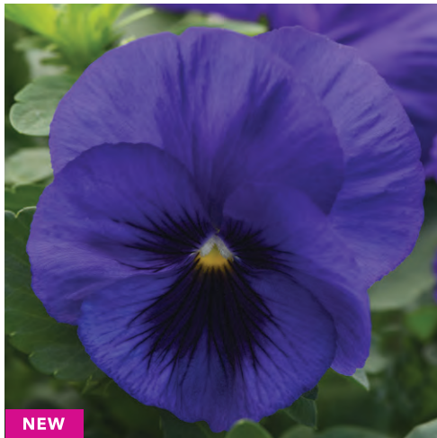
NEW Blue Blotch